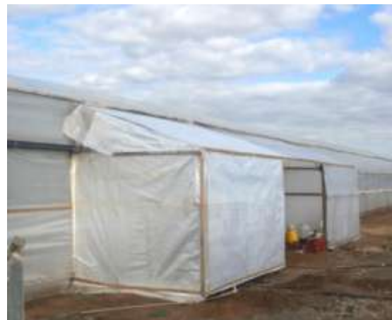
Double entry door under construction

If you have meshed the sides and any roof vents why leave a weak spot at the doors? pest entry can be reduced at doorways by designing and building a suitable double door with a small ‘porch’ or lobby between each door. The idea is to enter through one, close it and then open the second one. This will reduce the pest entry rate and yellow sticky tape can be installed in the porch to attract and catch thrips, whitefly and aphids as they move through this space.