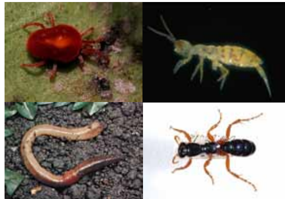
^ Figure 1: Soil Organisms.

Plant residues originating from legumes or which are high in nitrogen decompose rapidly, and are unable to maintain surface cover over extended periods of time.