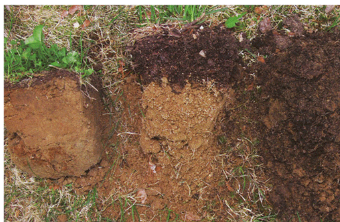
^ Figure 4: The soil on the left was transformed by regular addition of compost.

Many soils do not hold the maximum soil organic matter possible, which provides opportunity to improve current levels of soil organic carbon.